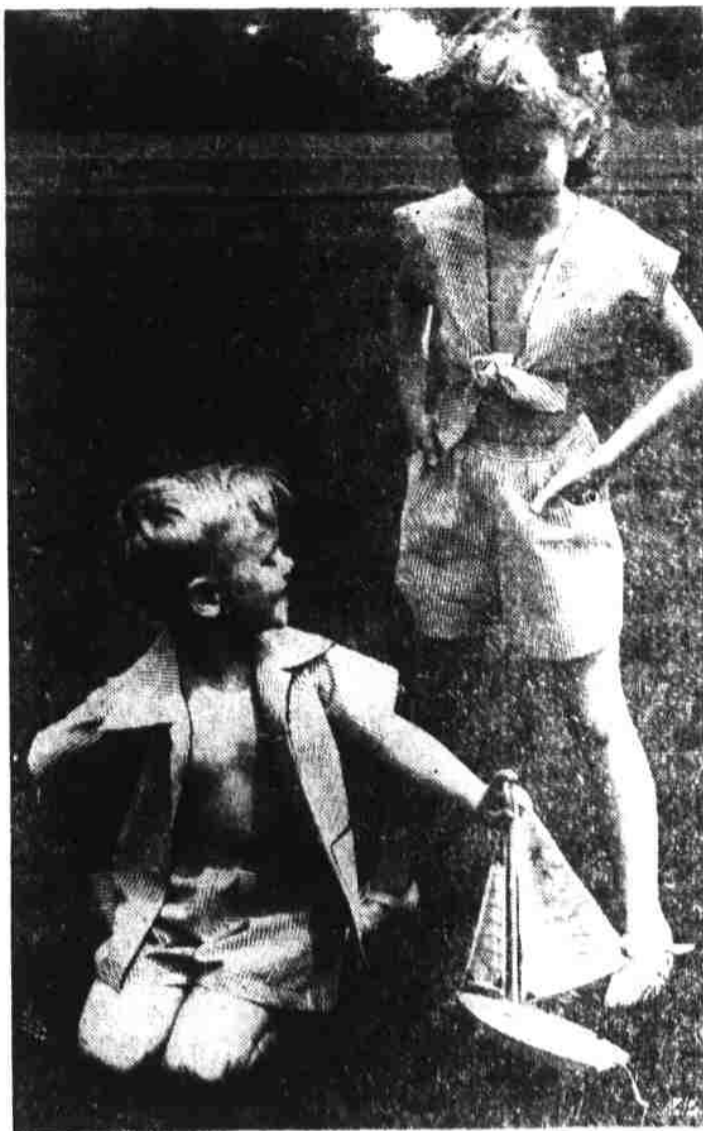
The young yachtsman sports shorts and beach coat of sturdy crinkled seersucker (Simplicity Pattern 2891), to match his mother's bow-tied top and shorts (Simplicity Pattern 2911). A boon to mothers because they need no ironing.