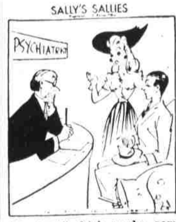
"He doesn't drink, smoke, gamble, but—he won't 'sew' wash dishes, or scrub the floors."