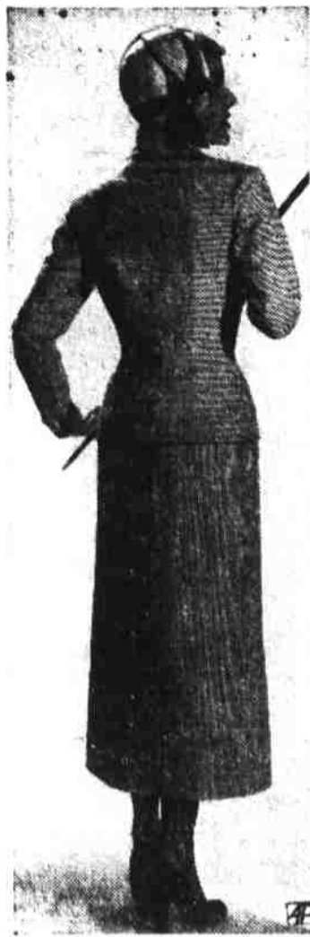
FRENCH INSPIRED . . . The back-buttoned suit introduced in Paris, in cotton striped cord by Avondale. (Butterick Pattern 4779).