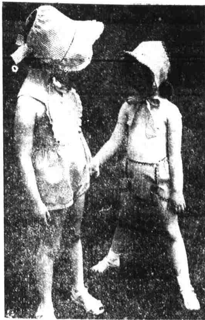
WORK SAVERS . . . No ironing is required for these cute seersucker play togs. Sunbonnet Sue, at left, is wearing a playsuit that comes with a dress (Simplicity Pattern 2890) while her pal at right has an even bracer outfit, with a bolero (Simplicity Pattern 2892).