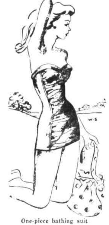
By VERA WINSTON

DARLING daughter looks lovely this season, whether she plunges into the bring or just drapes hera period of "anything goes" for swim togs, back we come to the graceful one-piecer but all done up in new figure-flattering charm. in front for prottiness and ease. The top is strailless (a naiter string detachable if desired). There is a cuff over the bra tep. and the suit is zipped in oack.