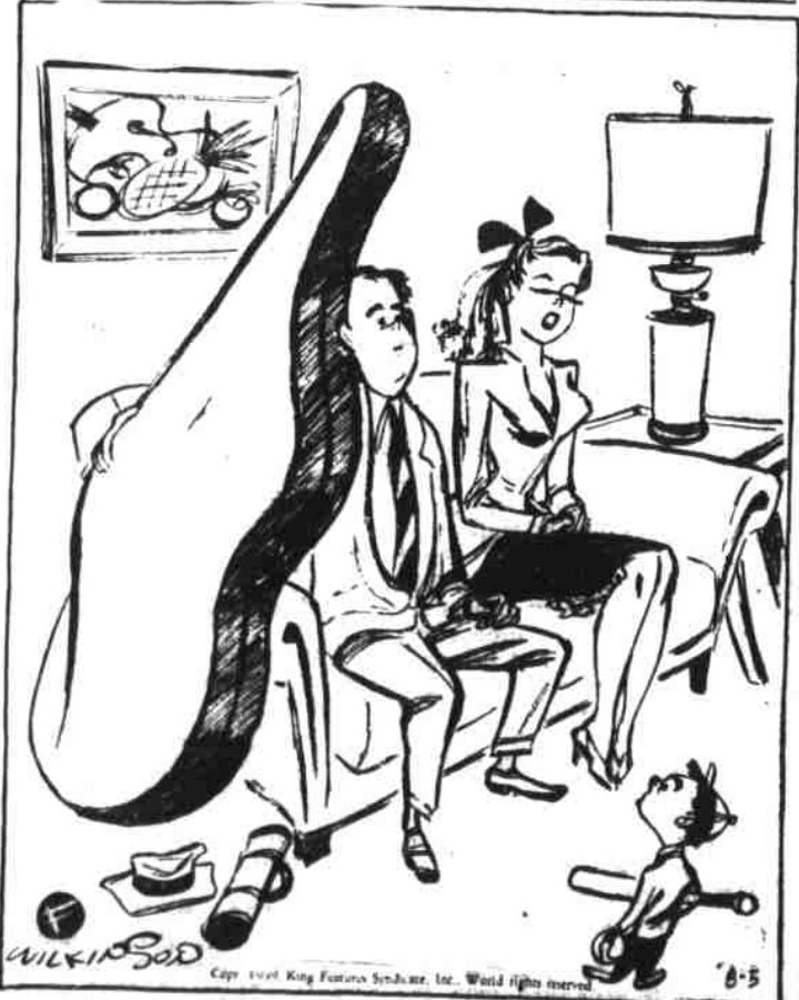
"He plays first b-a-s-s for Philadelphia-not b-a-s-e!"