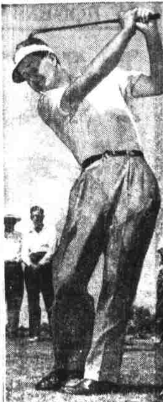
BYRON NELSON "Don't Worry About Others"