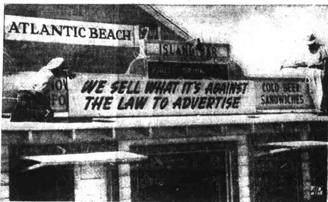
Beer signs are coming down and others are being up throughout North Carolina as dealers hasten to comply with a new law forbidding them to advertise the sale of beer and wine. This concession at Atlantic Beach near Morehead City has a sign which speaks for itself. It reads: "We Sell What It's Against The Law to Advertise."