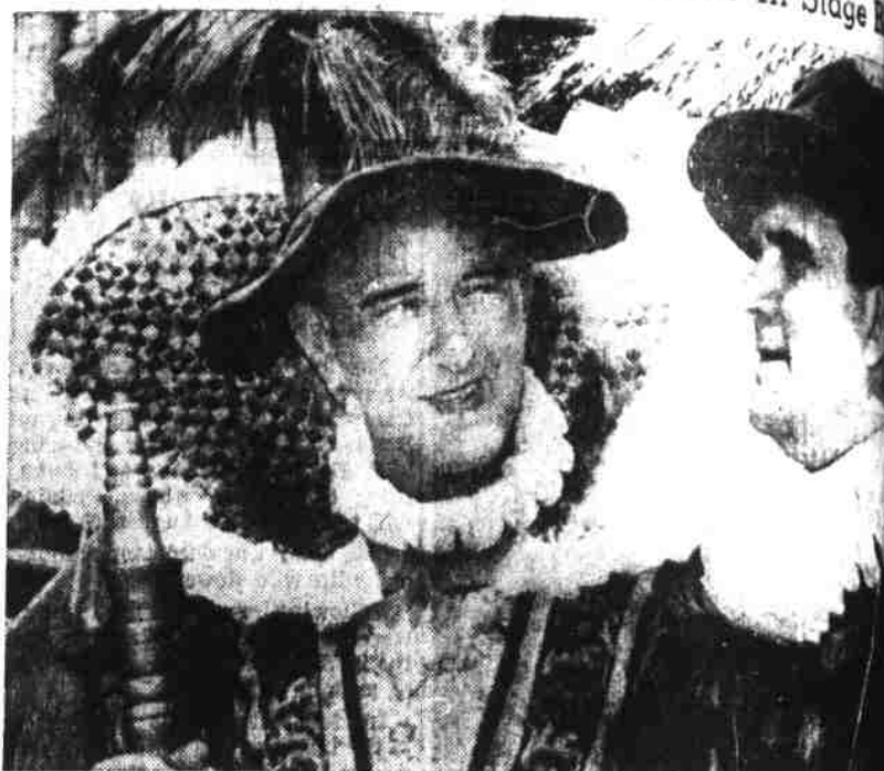
Undersecretary of State James E. Webb (right) put aside affairs of state temporarily for a historic stage production, "Lost Colony," on Roanoke Island, North Carolina. The Capt. Armadas, one of Sir Walter Raleigh's sea captains who brought the first English settlers to Roanoke Island. At left is Kay Kysner, radio and screen comedian, secretary of state of the state of North Carolina. Webb is from Oxford and Kysner from Rocky Mount.