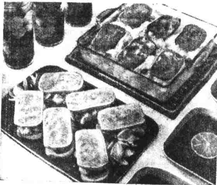
MEAT POTATO SALAD CASSEROLE... Use canned meat.