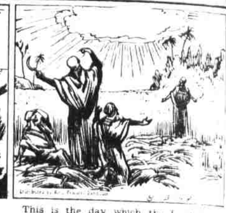
This is the day which the Lord made, we will rejoice and be glad . for He is good MEMORY VERSE- Podim 105