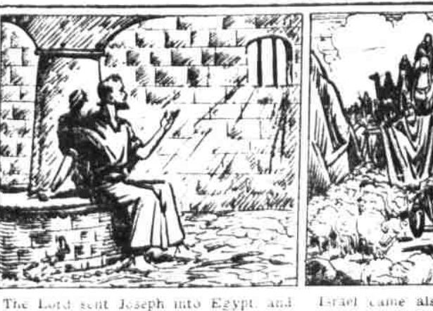
he was sold as a scivant and was a

Salvation Army WAYNESVILLE-Mountain Mission Center