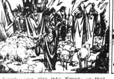
Jacob sojourned in the land of Ham; and the Lord increased His people greatly and made them strong.

ing at 8 00 through August 21-1 The public is must condially in second floor of the Masonic Temple at II o'clock