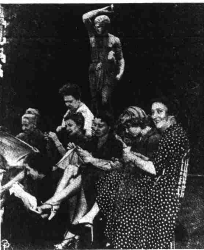
WITH FRENCH SEAMSTRESSES determined to stay out on strike until their demands are met, Parisian fashion houses have resorted to drastic measures to combat the situation. Above, mannequins of a big Paris concern try their hand at sewing. The seamstresses, who are paid fifteen cents an hour, are holding out for a four-and-a-half-cent raise.