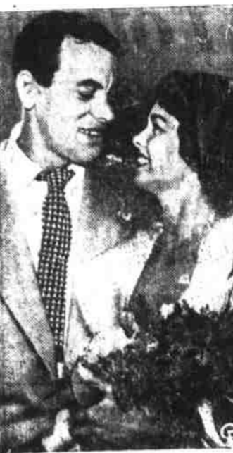
ACTRESS Joanne Dru and John Ireland are shown in La Jolla, Calif., after their wedding. The wedding took place a short distance from the theatre where they will co-star in a play. Joanne was recently divorced from singing star Dick Haymes, who married Nora Eddington Flynn, ex-wife of screen star Errol Flynn.