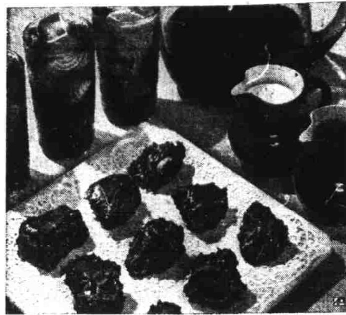
DELICIOUS ICED COFFEE... Serve it with fudge