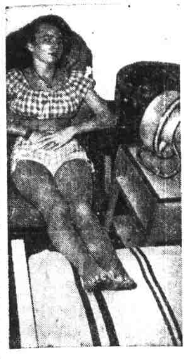
in front of a fan when overheated is had. Remove wet garments T Lemir at once. Keep warm clothes han-