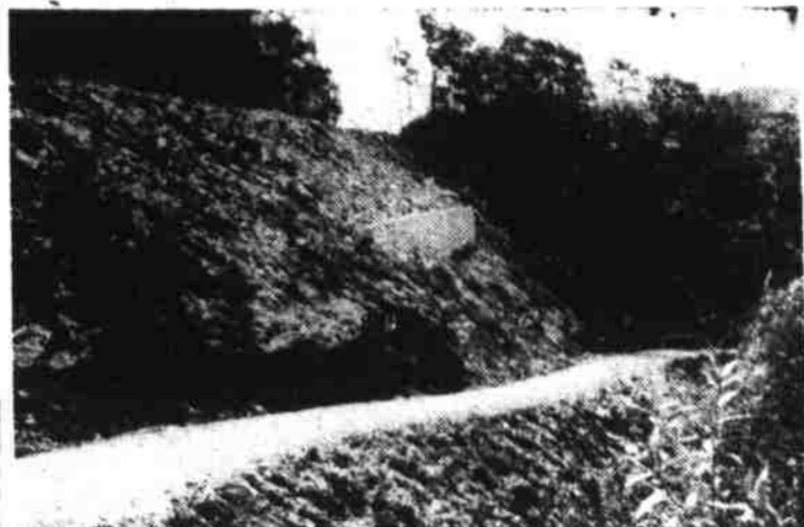
This scene was taken just after leaving Wagon Road Gap on Pisgah Mountain, and the descent is on the Haywood side. The lower road is No. 276 leading to Waynesville, and the upper road is part of the Blue Ridge Parkway, now open for five miles to visitors. A part of a huge stone retaining wall can be seen in about the center of the picture.