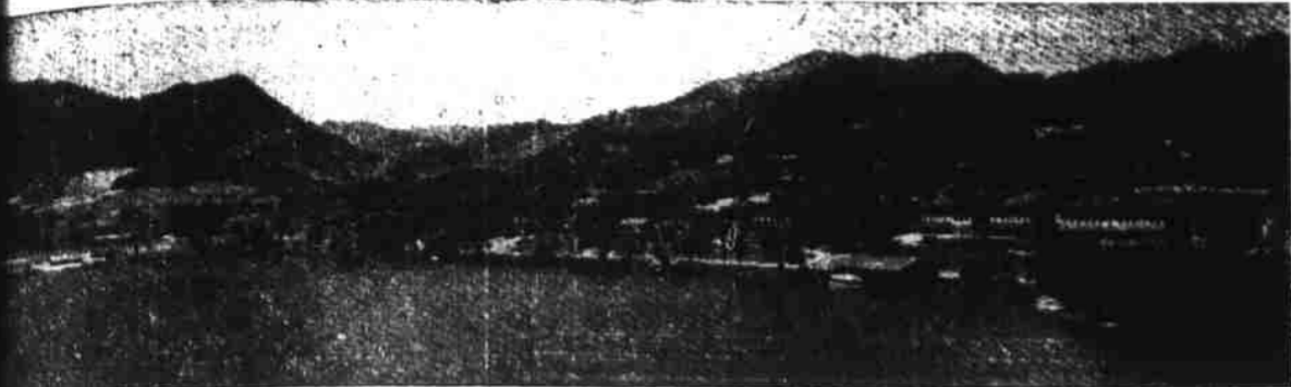
View of Lake Junaluska, taken from the bridge over the dam of the 250-acre lake. The hills of the area are dotted with the towers of the hotels that line the shoreline.