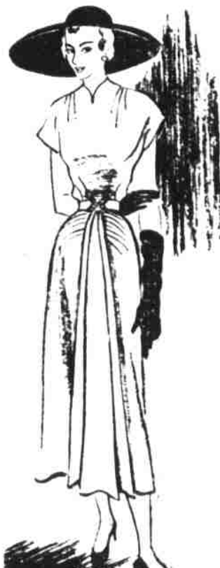
Taupe gray crepe frock.