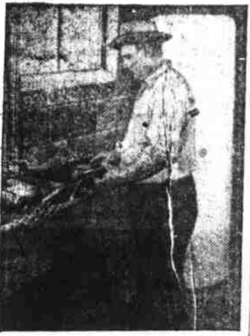
IT TAKES hot water—and plenty of it—to clean milking utensils adequately.

Like ham and eggs, running water and water heaters go together. These twin conveniences do as much as anything to bring urban living conditions