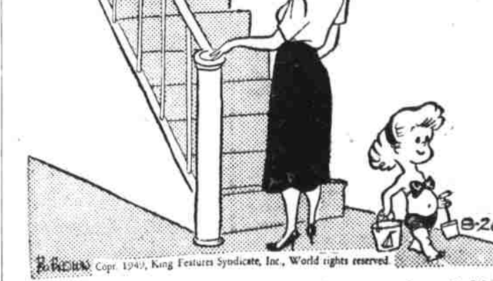
"Mom! Have you seen anything of my new bow tie?"