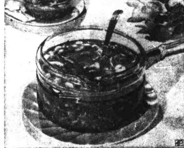
MINSTRONE . . . Noon time soup for small-try

By CECILY BROWNSTONE Associated Press Food Editor A good hot plate of soup will help satisfy lusty young appetites home from school at noon. You can make it a hearty homemade hotful like minestrone, or you can use some of the convenient canned soups.