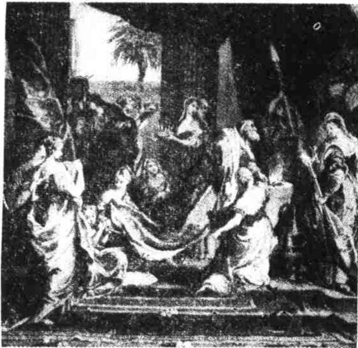
The evil doing of King Solomon. "Glory ye in His holy name; Let the heart of them rejoice that seek Jehovah."—Psalm 105:3.