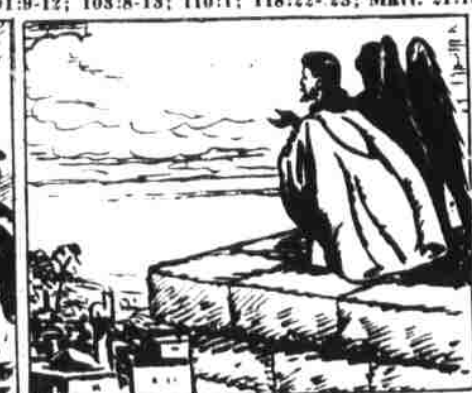
When Jesus was tempted in the wilder ness. Satan told Him to cast Himself from the top of the temple, "for He (God) shall give His angels charge over Thee," that no harm come.