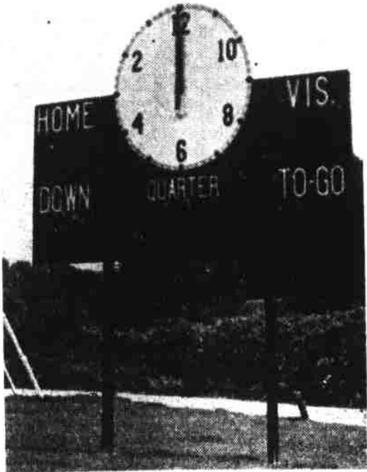
(Full details of the first home game of the season, with Tryon tomorrow night, may be found on pages 2 and 3 of the second section).

This giant time clock and score board is the latest convenience added to the Waynesville Township High School football field for the convenience of fans. Electrically operated, it tells the time left in each quarter, the score of the moment, yards to go for a first down or touchdown, quarters, and the downs. It was bought and erected on the east end of the field last July. You can see identical clocks at North Carolina State College, the University of Illinois, and other colleges throughout the country.