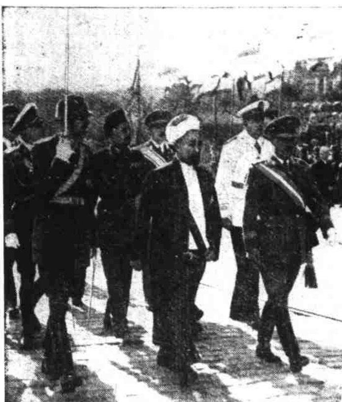
RULER OF TRANSJORDAN, King Abdullah walks beside Generalissimo Franco of Spain, as they review the honor guard turned out for the Hashemite king's arrival in Coruna. Abdullah is the first chief of state to visit Franco since the latter took power in Spain.