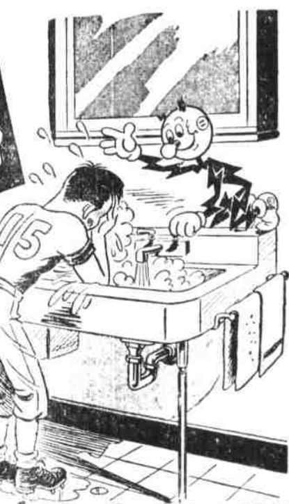
after the GAME

Answer: The answer is no, according to W. A. Stephen, extension beekeeper at State College. Stephen says the death of the mouth part of bees makes it impossible for them to do this. They will suck the juice of fruits but only after the fruit skin has already been injured in some way. Normally bees will not even bother with this juice at all if nectar is available, but often during the time when fruits are ripening there are very few flowers in bloom on which the bees can work. For experimental purposes, bees have been placed in cages with healthy fruit. In every such case, they were unable to get any juice from the whole fruit and as a result died of starvation.