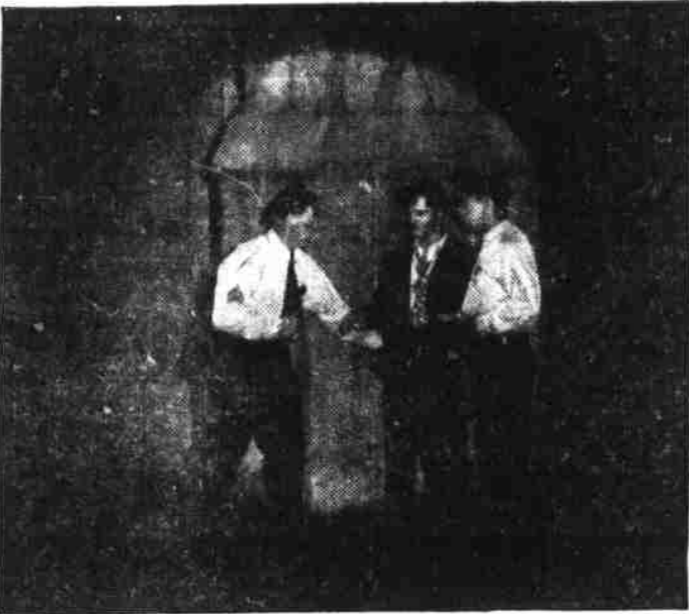
End of the trail for 'Pretty Boy' John Derek in Columbia's compelling screen version of 'Knock On Any Door'...