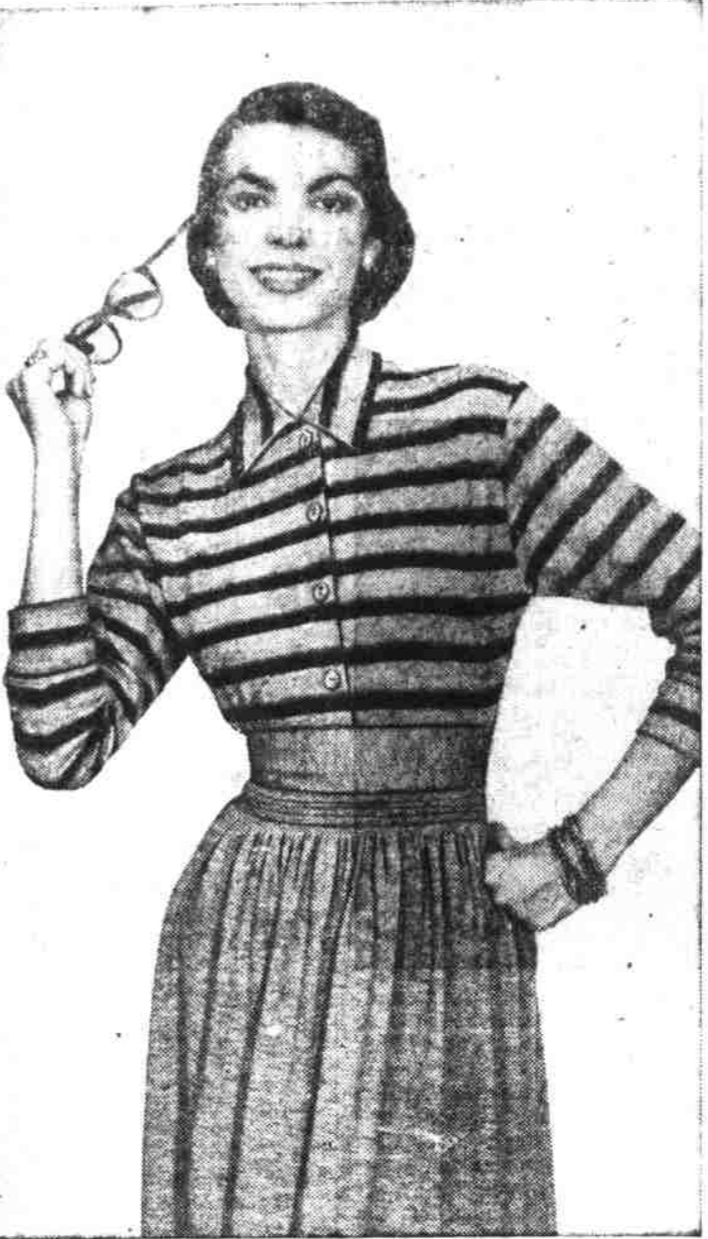
Every college girl knows that 1 and 1/2 and 2 and the sum adds up in this case to a canvas ensemble...