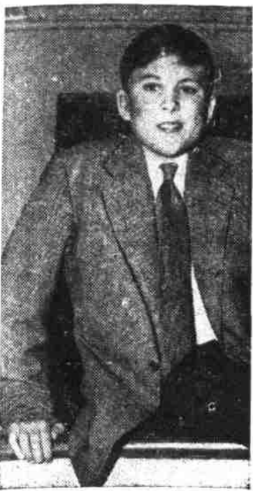
AMONG the passengers who arrived in New York aboard the Queen Mary was Lance Revenlow, 12-year-old son of heiress Barbara Hutton Troubetzkoi. He visited his mother abroad and stayed longer than usual with her because she was ill. He is returning to school at Newport, R. I.