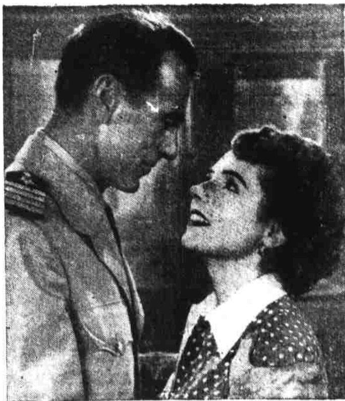
Task Force, a thrilling picture, featuring Gary Cooper and Jane Wyatt will be seen at the Park today and tomorrow. The advertisement of the Park will be found on page 4 of the second section.