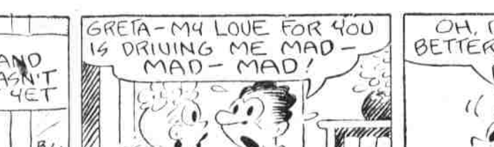
By DUDLEY FISHER