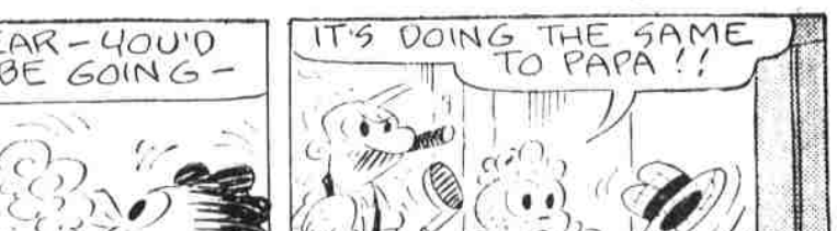
By DUDLEY FISHER