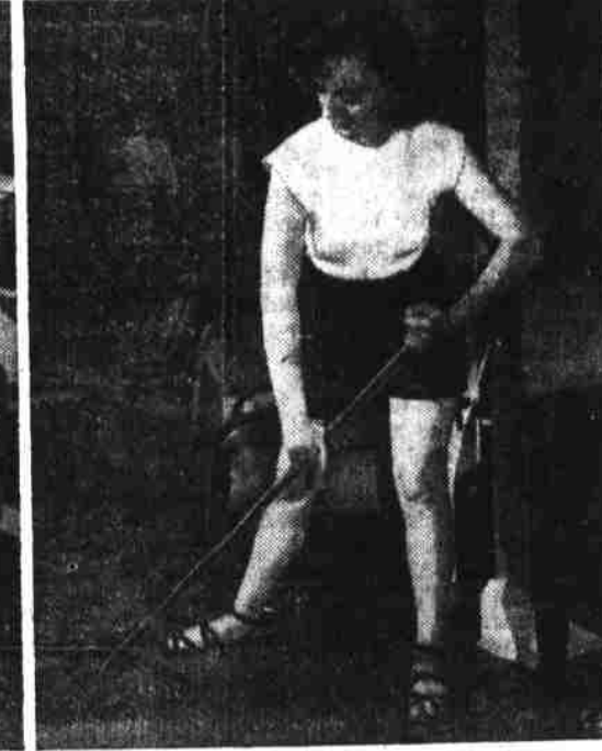
knees straight when dusting.

she dusts a chair. Good for the arms. For many years, the Parsees of | Prior to the California gold rush,