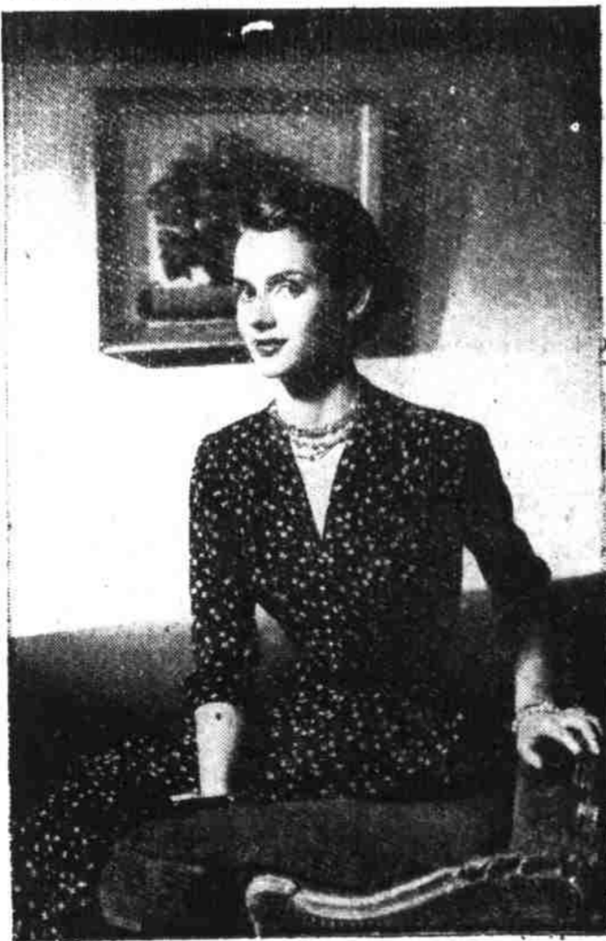
Bottle print Nelda crepe — Abstract bits of color on brown, black, prune, navy rayon. Draped bodice, easy skirt. Washable. 13-15.

Note the new adjustable waist length feature in every Nelly Don dress! Two rows of stitching at waistline tape. Waist may easily be made longer by ripping top row of stitching. Leave "as is" for moderate length.