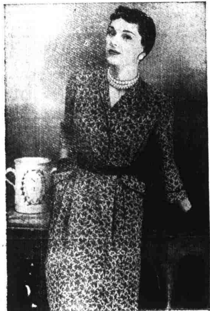
Florentine scroll print—Nelda crepe rayon. Reversible taffeta rayon belt. Wine with gray. Blue with blue, green with brown. 19-20.