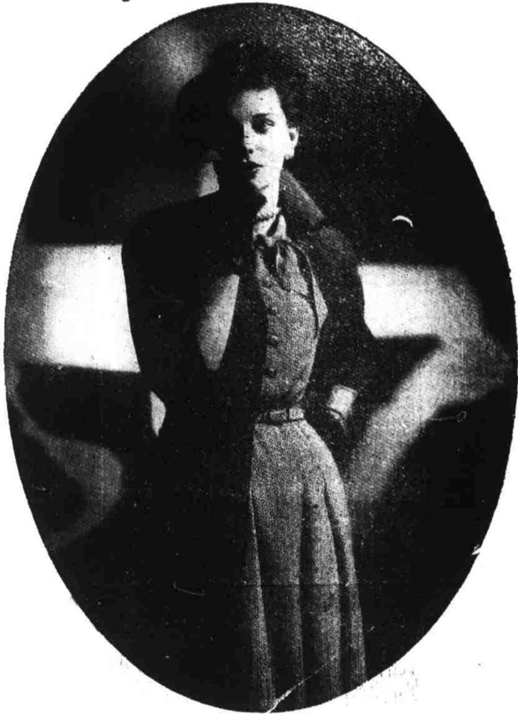
Companion coat dress