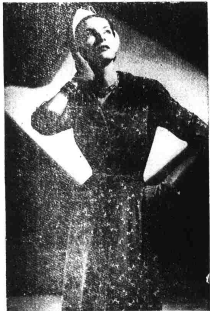
Autumn-crocus Nelda print crepe rayon—Drawstring dress in cinnamon, teal, claret. 14-16. Same style, sparkle print, 14½-22½.