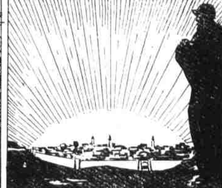
I will restore thy judges and thy counsellors as at the beginning, afterward thou shall be called the city of rightcousness, a faithful town.