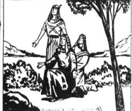
the Egyptians shall know Jehovah in Eat day, and shall vow a vow unto Jehovah, and shall perform it