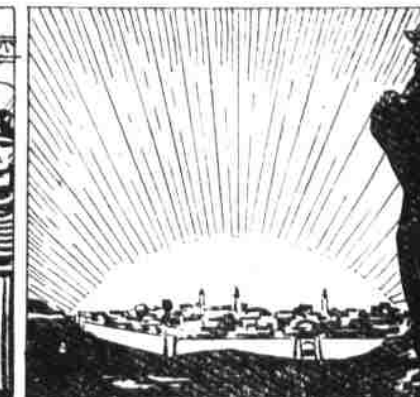
gifts, and followeth after rewards.