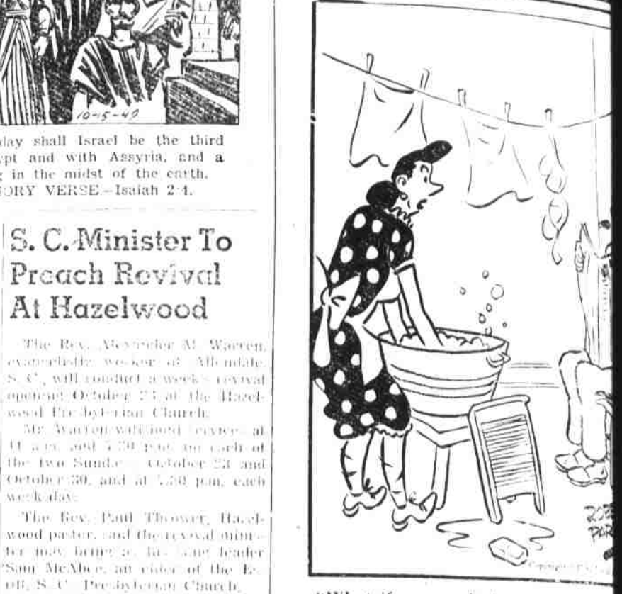
"What if you can't do as well as the LAUNDRY, I'm satisfied."

New Convenience. Savings...New Thrills Are Yours W