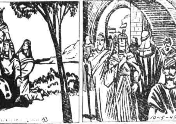
with Fgypt and with Assyria, and a blessing in the midst of the earth. MEMORY VERSE-Isaiah 2 4.