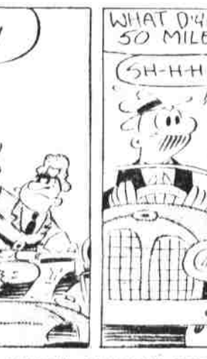
RIGHT AROUND HOME