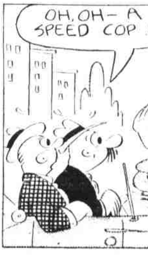
RIGHT AROUND HOME