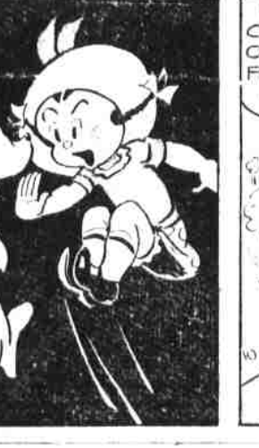
RIGHT AROUND HOME