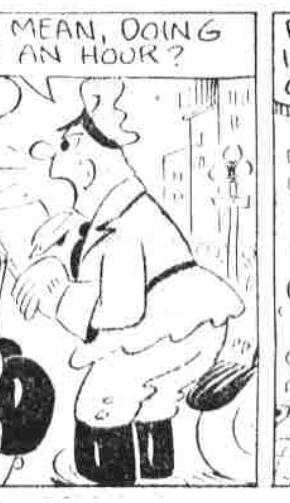
RIGHT AROUND HOME