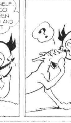
RIGHT AROUND HOME