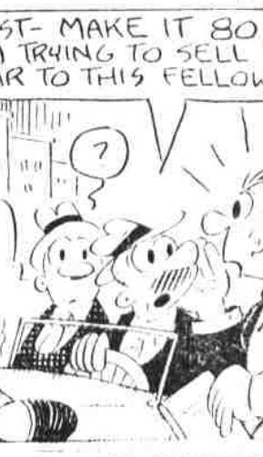
RIGHT AROUND HOME