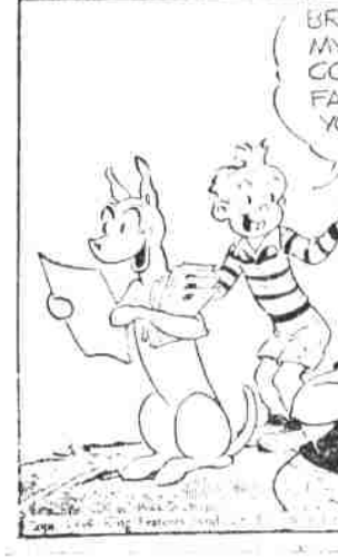
RIGHT AROUND HOME