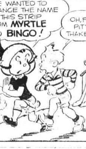
RIGHT AROUND HOME