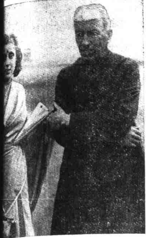
Indian Prime Minister arrives in London with his sister, Krishna...