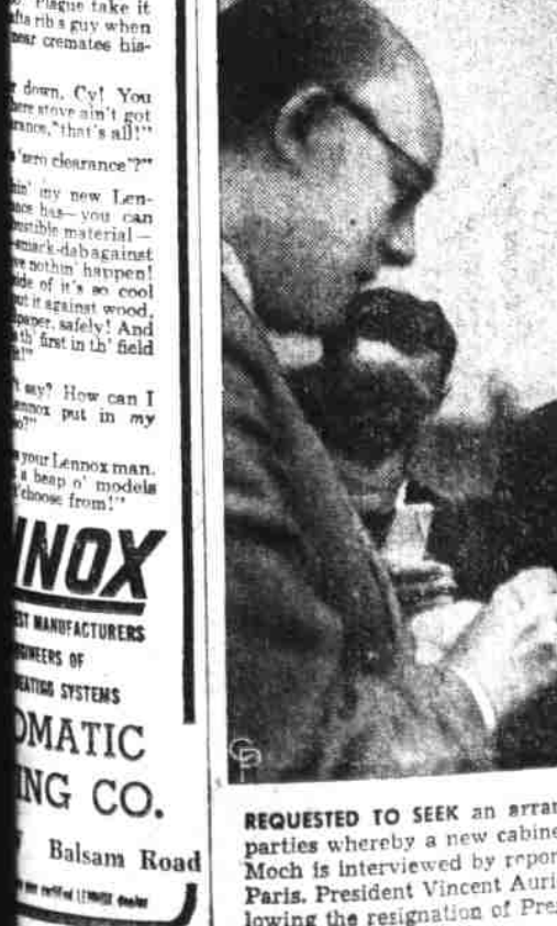
REQUESTED TO SEEK an arrangement among France's major political parties whereby a new cabinet can be formed, Socialist Minister Jules Moch is interviewed by reporters on leaving the Palais de L'Elisee in Paris.