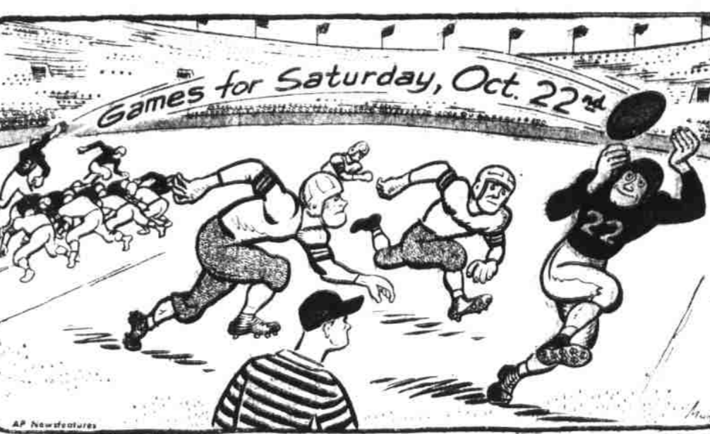
RECORD TO DATE —82 wins, 26 losses, 7 ties, Pct. .759

By FRANK ECK AP Newsfeatures Sports Editor