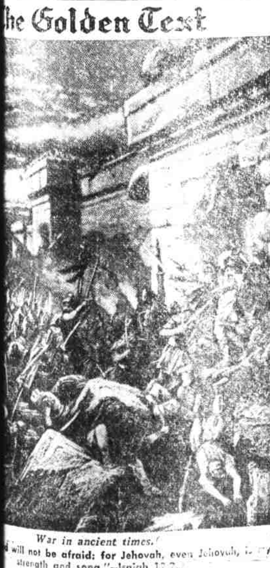
War in ancient times. "I will not be afraid; for Jehovah, even Jehovah, is my strength and song."—Isaiah 12:2.