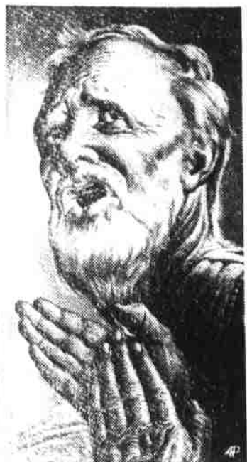
Copyright 1949 by Oxford University Press, Inc.

And God said unto Abraham, As for Sarah thy wife, thou shalt not call her name Sarah; but Sarah shall her name be. And I will bless her, and she shall have a son also; yea, I will bless her, and she shall have a son also of her; yea, I will bless her, and she shall have a son also of her. And Abraham fell upon his face, and the Lord said unto him, I have said unto thee, that thou shalt not walk before me, and thou shalt be perfect. And I will establish my covenant with thee, and with thy seed after thee.