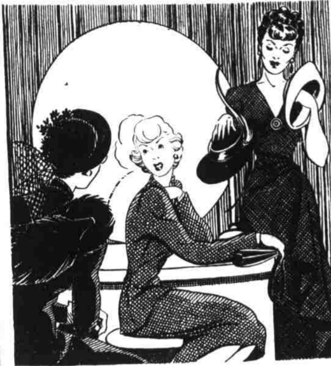
Mrs. Ainstree caught the level look from Arleta's dark eyes.

"It isn't remote! Besides, he told me I could make a choice. And, Aunt Leta," the voice swelled