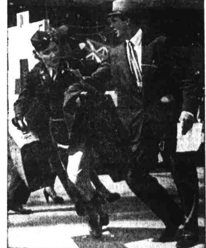
Ann Sheridan is in a hurry to get Cary Grant all dressed-up as a "bride" in this hectic scene from "I Was a Male War Bride," the hilarious comedy opening at the Strand Theatre Tuesday.