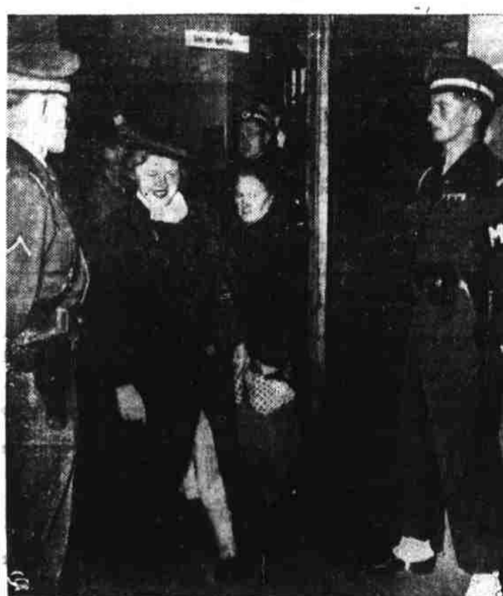
Flanked by two MP's and followed by a German prison matron, Ilse Koch, so-called "witch of Buchenwald" is released from a Landsberg, Germany, prison where she had served four years for alleged concentration camp atrocities. Her life sentence was reduced by American occupation authorities who reviewed revolting charges and decided the evidence was not conclusive. Her freedom was short lived, for she was immediately rearrested by German authorities who will try Ilse on charges of murdering 25 German-Jews.