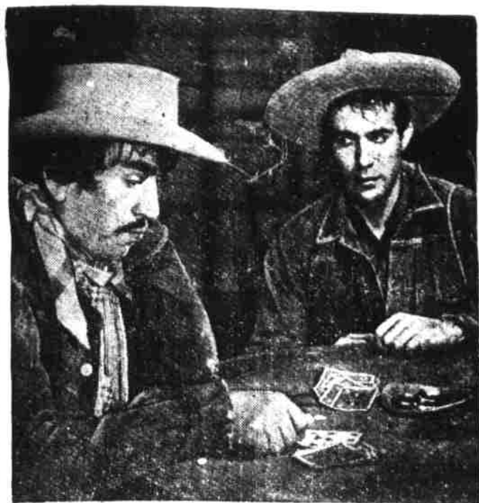
George Murphy, Ricardo Montalban and all-star cast in "Border Incident".