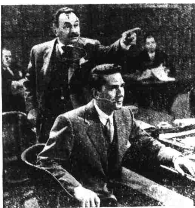
If 'The Court Please' Edward G. Robinson and Richard Conte play for freedom in this dramatic scene from 'House of Strangers'.