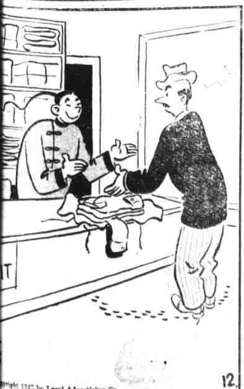
particular as you should send his shirts to the WAYNESVILLE LAUNDRY.