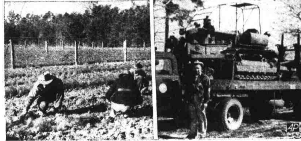
Under direction of the Forestry Division of the State Department of Conservation and Development, tree culture and preservation are going forward in North Carolina. These pictures give you some idea of how the department carries out its program. Top: Employees operate one of the tree-planting machines owned by the department. It is drawn by an ordinary tractor. With the machine, two men can plant 10,000 seedlings in one day. This number of seedlings would reforest about 10 acres of barren land. Lower left: Workers cultivate tree seedlings at the department's Clayton forest nursery. Ten million seedlings are being raised there. Soon after frost, the seedlings will be lifted from their beds, graded, tied into bundles and shipped to forest landowners throughout the state. Lower right: One of the several heavy forest fire fighting units owned by the Forestry Division. The unit consists of a trailer truck, a crawler type tractor and a large disc plow. It is taken to large forest fires to plow fire lines for stopping advancing flames. (AP Photos).