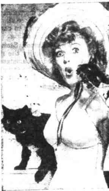
BEING black was not unlucky for this cat, who was selected to pose with June Haver of the films in honor of National Cat Week. The American Feline Society sponsors the annual festivity to publicize the household pets.