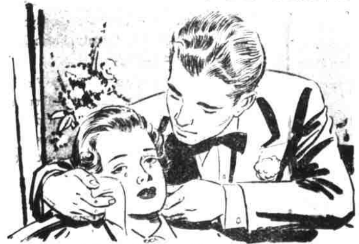
Is it neurotic to cry "for no reason"?

By LAWRENCE GOULD Consulting Psychologist