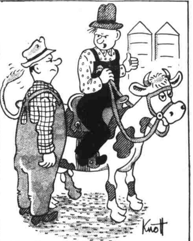
"WELL, I TOLD YOU I'D NEVER WORKED ON A FARM BEFORE."