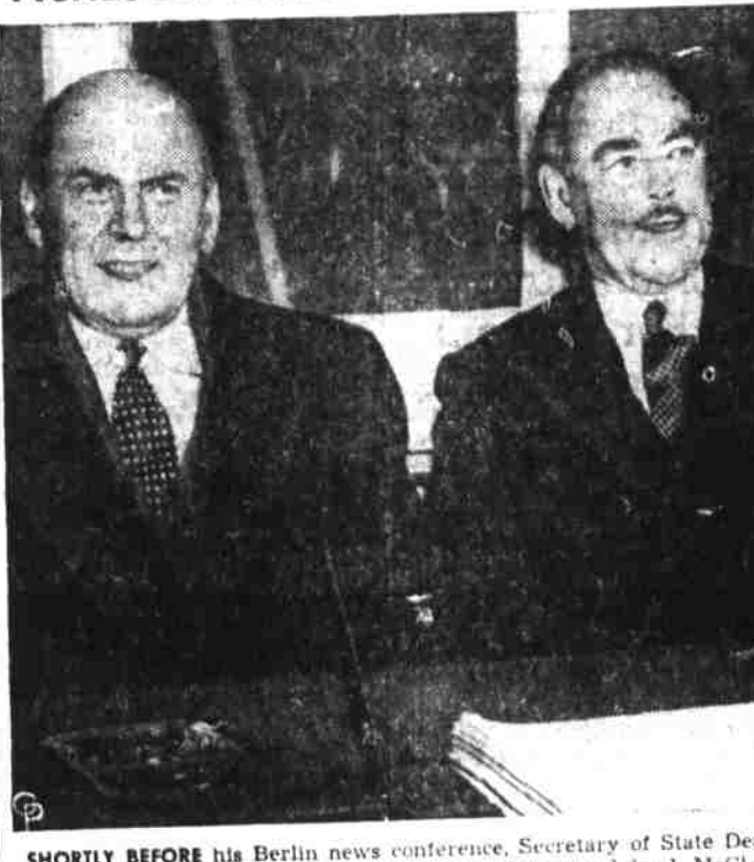
SHORTLY BEFORE his Berlin news conference, Secretary of State Dean Acheson (right) meets with U. S. High Commissioner John J. McCloy. Acheson told newsmen that America would support Germany's battle for liberty just as long as "they continue fighting for it."

Leta, that explains everything." "Everything?" "That's probably what happened here. Your father had the vision to see what controlled water supply would mean to this section. He unquestionably gained federal support, but down in that valley which must hold the rain and the snow shed, there were families who didn't want to give up their homes, so it was necessary to condemn the property."