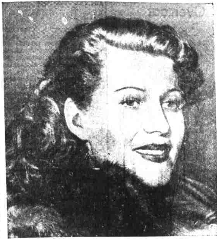
OUT FOR A DRIVE at Lausanne, Switzerland, glamorous movie star Rita Hayworth is shown in an open car, letting the wind whip her hair about her face. Wife of Prince Aly Khan, Rita is reported resting and reading movie scripts as she awaits the birth of her baby.

Sheridan" And when she meshed gears angrily, he added, "Considering the roads, keep your temper for Doakes." "Miss Langtry," Cal held his breath as the car slithered out of the narrow lane onto the road, leaving a crater.