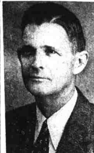
ber coming in South Carolina Farm Bureau as well as will address Saturday's me ing of the Haywood County Furn ily group in Bureau and its Auxiliary The is publishing session will be held in commune-

These Are Among The Many From All Parts Of The State Coming To Festival