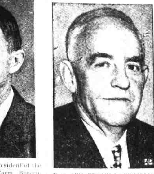
U.S. SEN, FRANK P. GRAHAM of Coapel Hidi will address the Ha wood County Tobacco Harvest be avail audience here Fra-