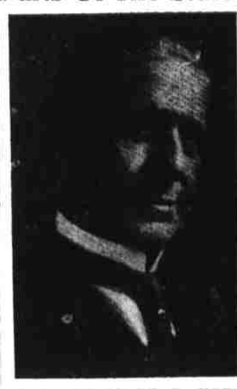
of Shelby will be the principal speaker on the Festival program on Friday atternoon at the Haywood County Court House