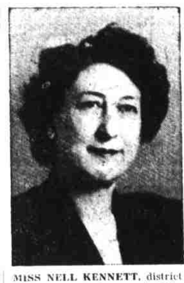
home demonstration agent of the State College Extension Service, will appear here this week during the Tobacco Festival.