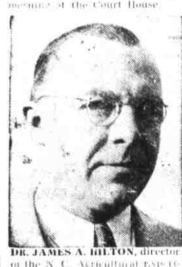
or the N. C. Agricultural Pespettment Station, will appear here this week in connection with the Festival. He is also dean of the N. C. State College School of