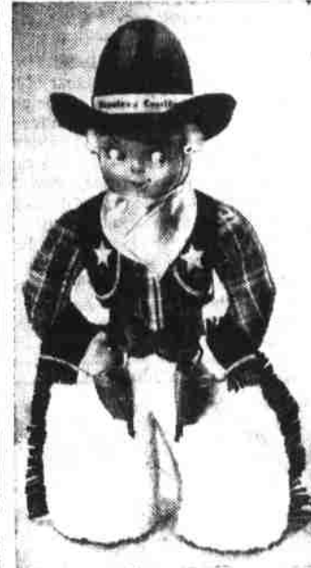
Laughs, cries of phono-