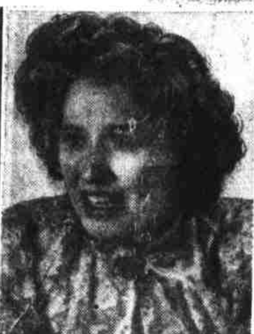
BARBARA STANWYCK in "Sorry, Wrong Number"