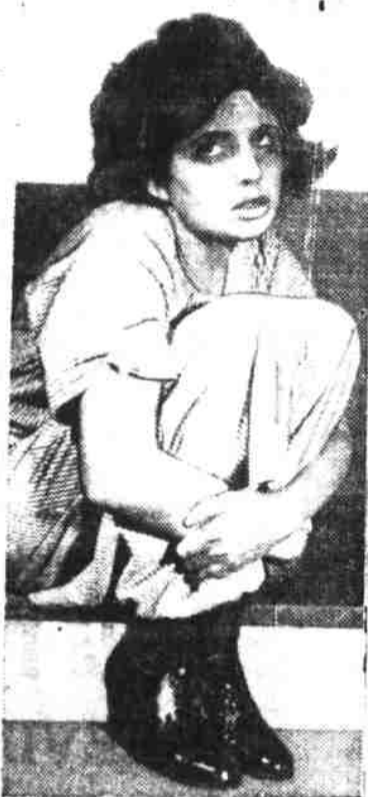
PEGGY CASS in her takeoff on "The Snake Pit"