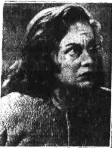
OLIVIA DE HAVILLAND in "The Snake Pit"