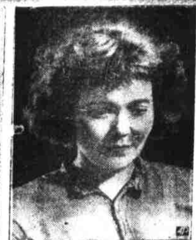
JANE WYMAN as a deaf mute in "Johnny Belinda"