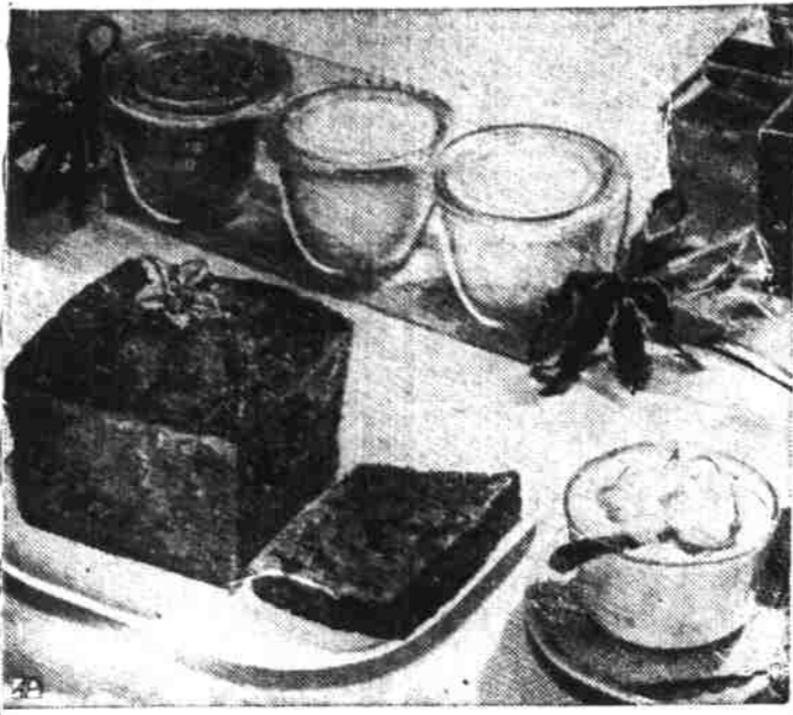
CHRISTMAS FRUIT CAKE — With varied sauces...