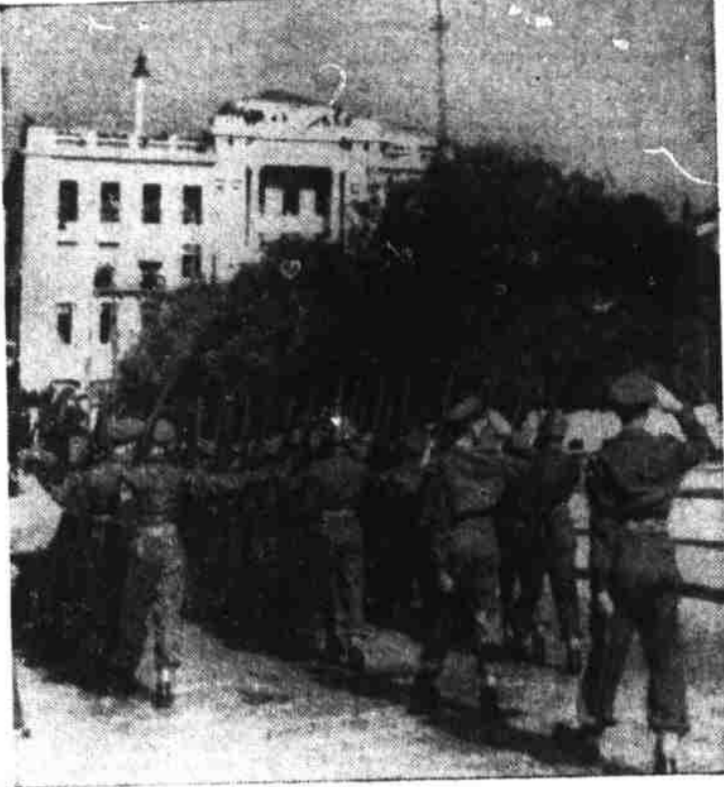
THE FIRST CONTINGENT of British forces to leave Greece marches past the tomb of the unknown soldier in Athens. They are members of the East Surrey regiment. Collapse of effective guerrilla activities made it possible for the British to withdraw many soldiers.