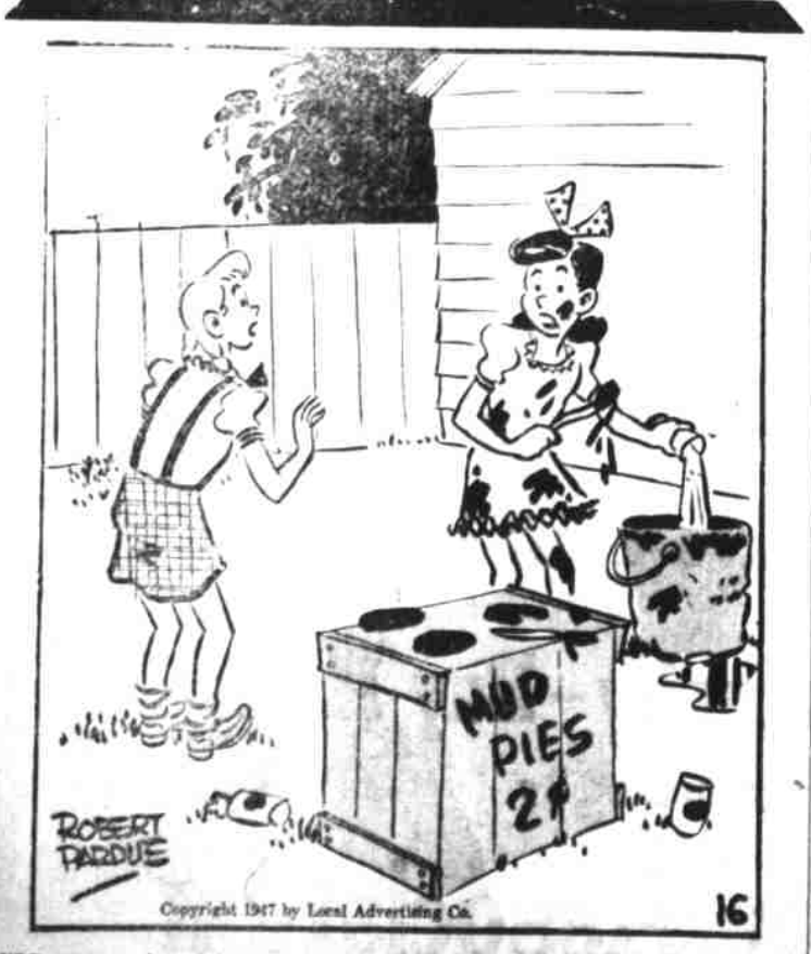
"Mom won't whip me . . . the WAYNESVILLE LAUNDRY always gets my clothes clean!"