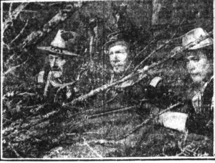
INDIAN ATTACK. From left to right, Captain John Wayne, Lt. Harry Carey, Jr. and Lt. John Agar reconnoiter as hostile Indians prepare for a deadly raid, in the John Ford-Merian C. Cooper presentation, "She Wore a Yellow Ribbon," in color by Technicolor. The trio co-stars in the Argosy Picture with Joanne Dru and Ben Johnson. Coming to the Strand Theatre Sunday and Monday.

PARK-SHOP SAVE RAY'S SUPER MARKET PLEASING IN QUALITY-PRICE-CONVENIENCE