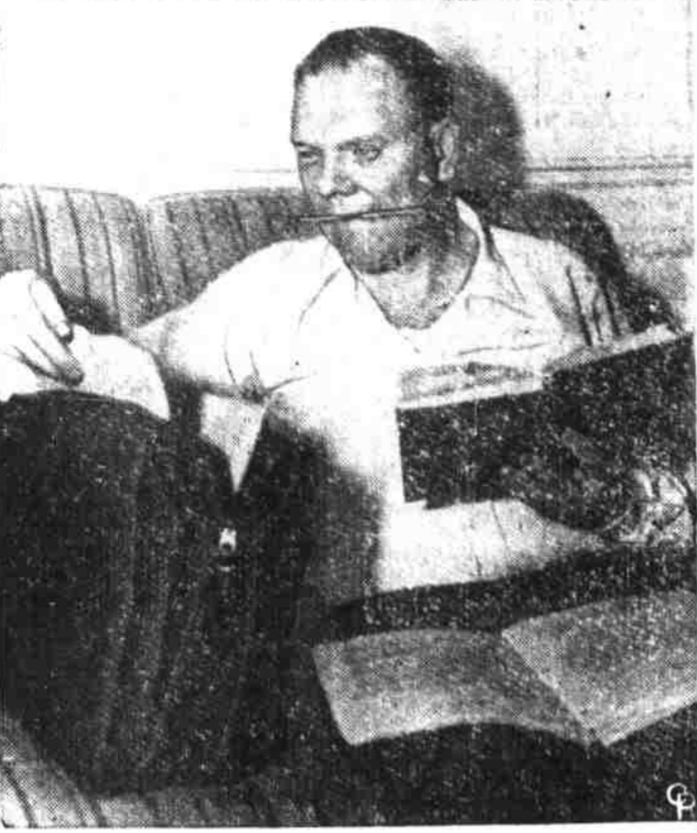
JORDAN WORKS ON NOTES FOR CONGRESSIONAL APPEARANCE