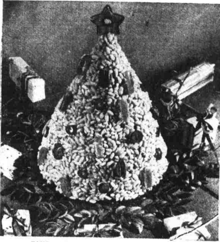
CANDY CHRISTMAS TREE . . . For the kiddies.

Method: Put puffed rice or wheat into a shallow pan. Heat in a moderate (350 F.) oven for 10 minutes. Pour into a large greased bowl. Melt butter or margarine, peanut butter, and marshmallows in a double boiler, stirring occasionally. It may take quite a little while to melt the marshmallows. Pour over puffed rice or wheat, stirring until the cereal is evenly coated. Pack half of mixture in a greased 7 x 11-inch pan; cover with chocolate pieces. Place in a moderate (350° F.) oven for 2 to 3 minutes, until chocolate pieces are softened. Remove from oven. Spread chocolate with a spatula; sprinkle with peanuts. Top with remaining puffed rice mixture. Cool and cut into bars.