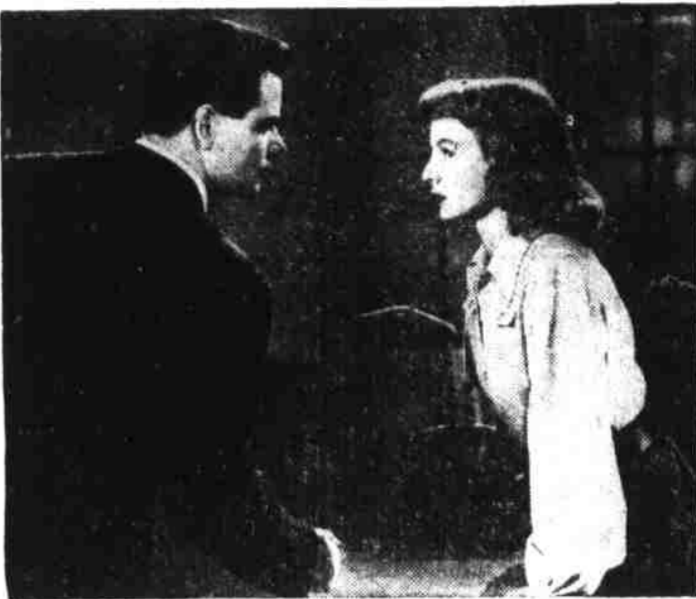
Every man is a soft touch for some woman... especially when the man is gambler Glenn Ford and the woman is social worker Evelyn Keyes. The picture is Columbia's "Mr. Soft Touch" at the Park Theatre.