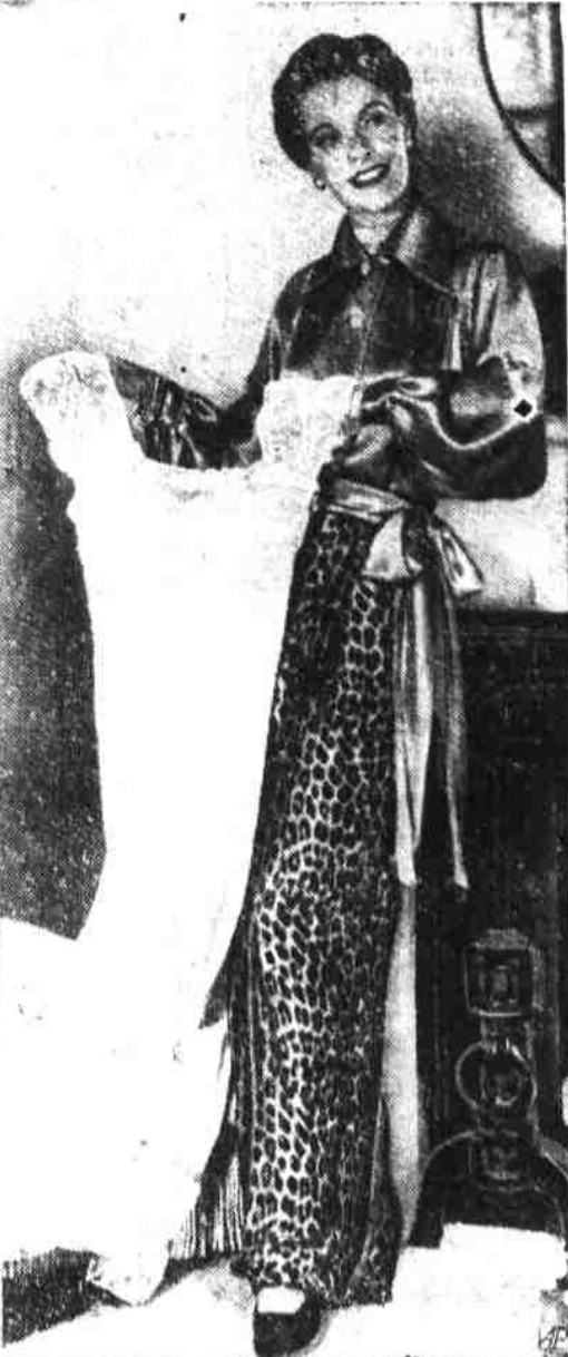
LUXURIOUS LOUNGING . . . For the exotic type—dramatic pajama outfit with leopard velvet trousers.