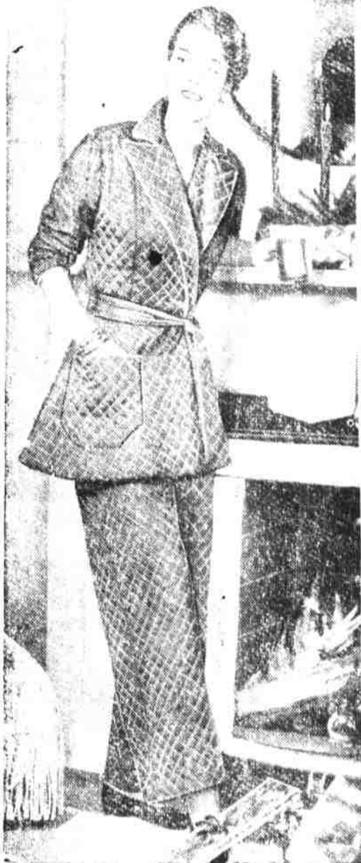
WARM GREETINGS . . . The quilted crepe lounging pajamas will keep her warm and pretty all winter long.