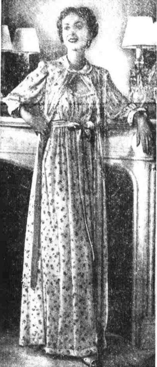
GRACEFUL IN SILK . . . A companion to her taste is this gown and peignoir set in flowered silk crepe with lace trim.