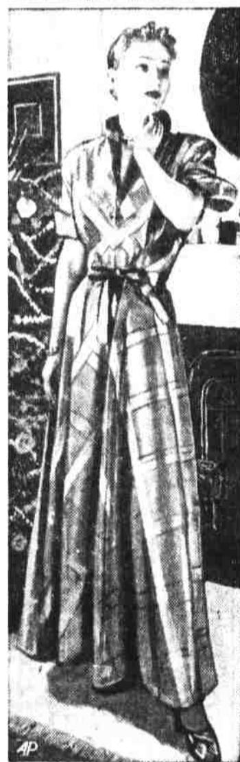
FIRESIDE COMPANION . . . Gay and colorful hostess coat in plaid taffeta, with zippered front closing and stand-up portrait collar.