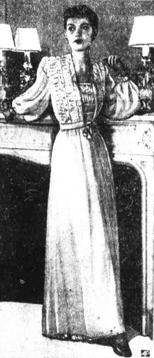
SHEER FLATTELY IN NYLON . . . Gift hit of the year—nightgown and negligee in filmy nylon, with lace trimming.