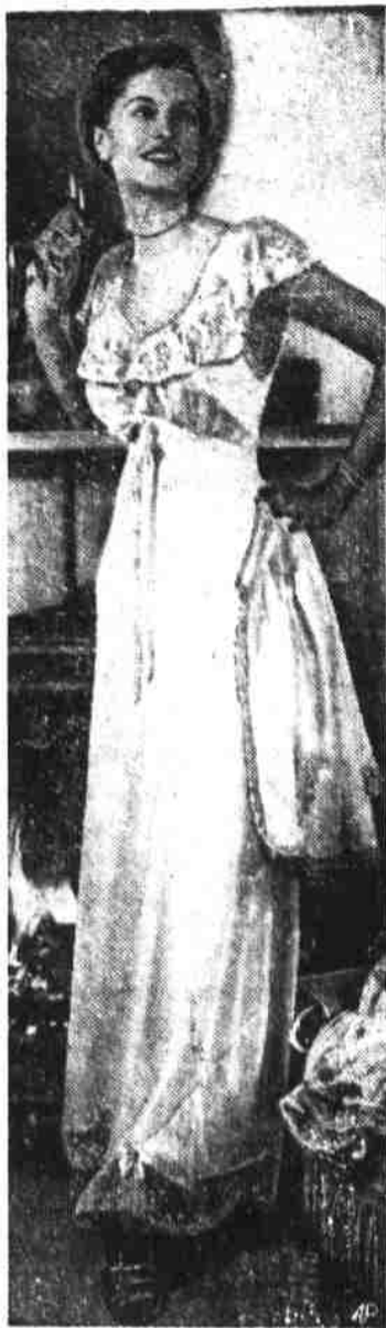
BOUDOIR ENSEMBLE . . . The perfect gift—white satin gown and matching bolero jacket in white satin with veru lace. Petticoat, slip and panties to match make complete ensemble.